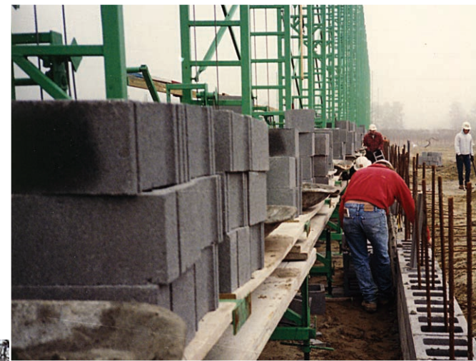
Photo 1 - The Non-Stop system was designed so masons can start the wall off the scaffold, eliminating a costly crew move when the wall gets scaffold high. Notice the masons' walk boards are stored under the workbench. The masons' outrigger is pulled out and the boards are dropped in place in seconds.

On that job, he tripled his projected profit. Stop and let that sink in. The labor number in your bid is five, six or seven times bigger than your profit number. On the average job, 15 percent of the labor number is equal to the profit number. Increase production by only 15 percent , and you double your profit.