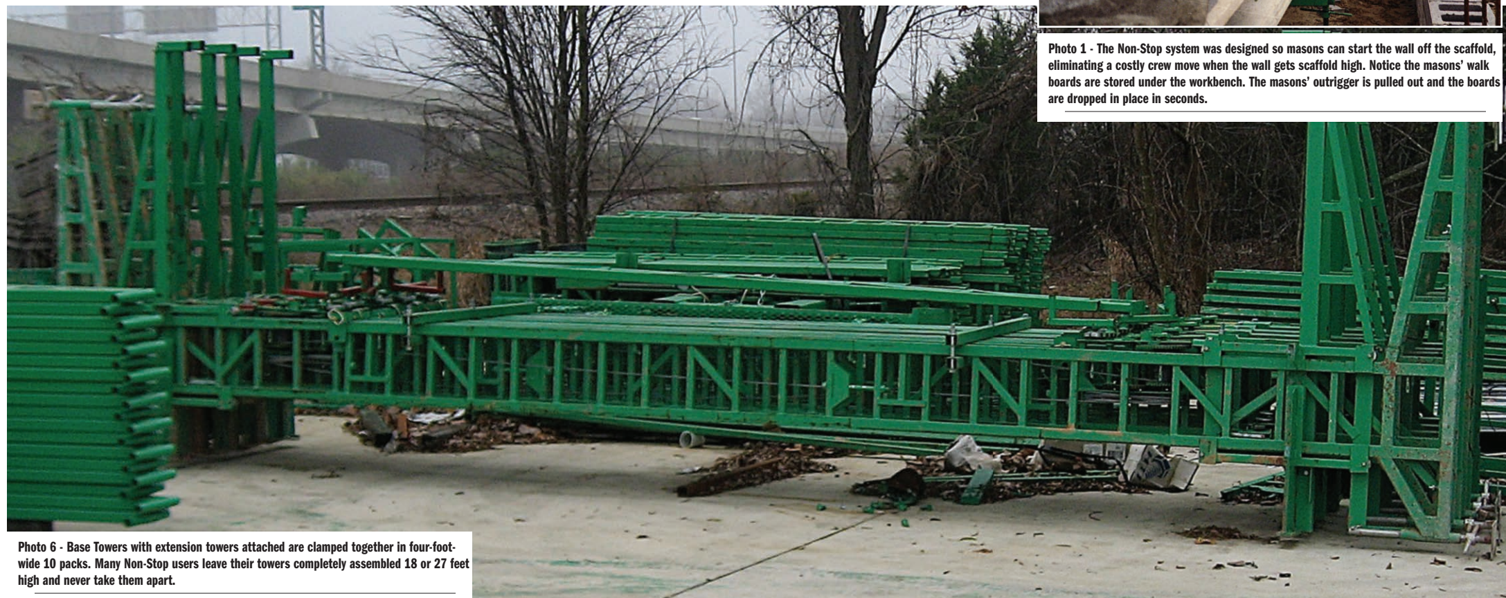
Photo 6 - Base Towers with extension towers attached are clamped together in four-foot-wide 10 packs. Many Non-Stop users leave their towers completely assembled 18 or 27 feet high and never take them apart.