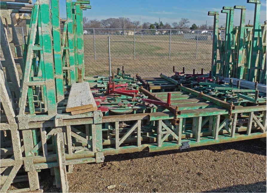
Photo 5 - This contractor clamps his base towers together in packages of 10. Each one is four feet wide, allowing him to put two packs across his trailer. Each pack is 14 feet long.