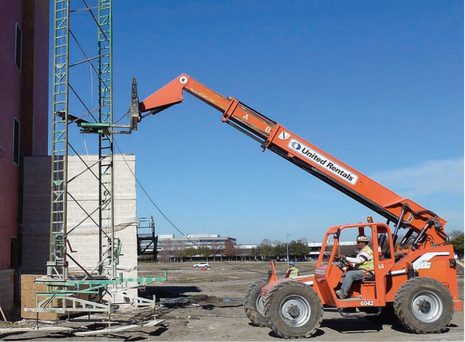
Photo 2 - The Swivel Forklift Bar allows your lift driver to grab towers from one wall and land them at the next wall in minutes, and at any angle. Notice the mud sills are nailed to the leveling jacks.